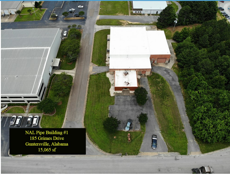
NAL Pipe Building #1 185 Grimes Drive Guntersville, Alabama 15,065 sf