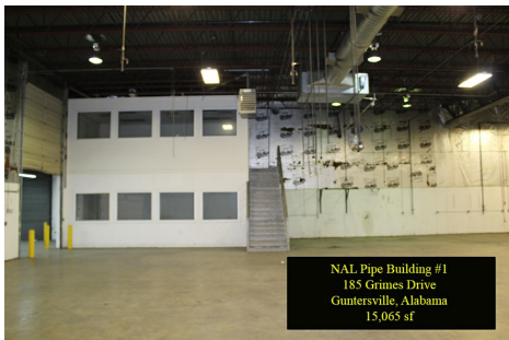
NAL Pipe Building #1 185 Grimes Drive Guntersville, Alabama 15,065 sf